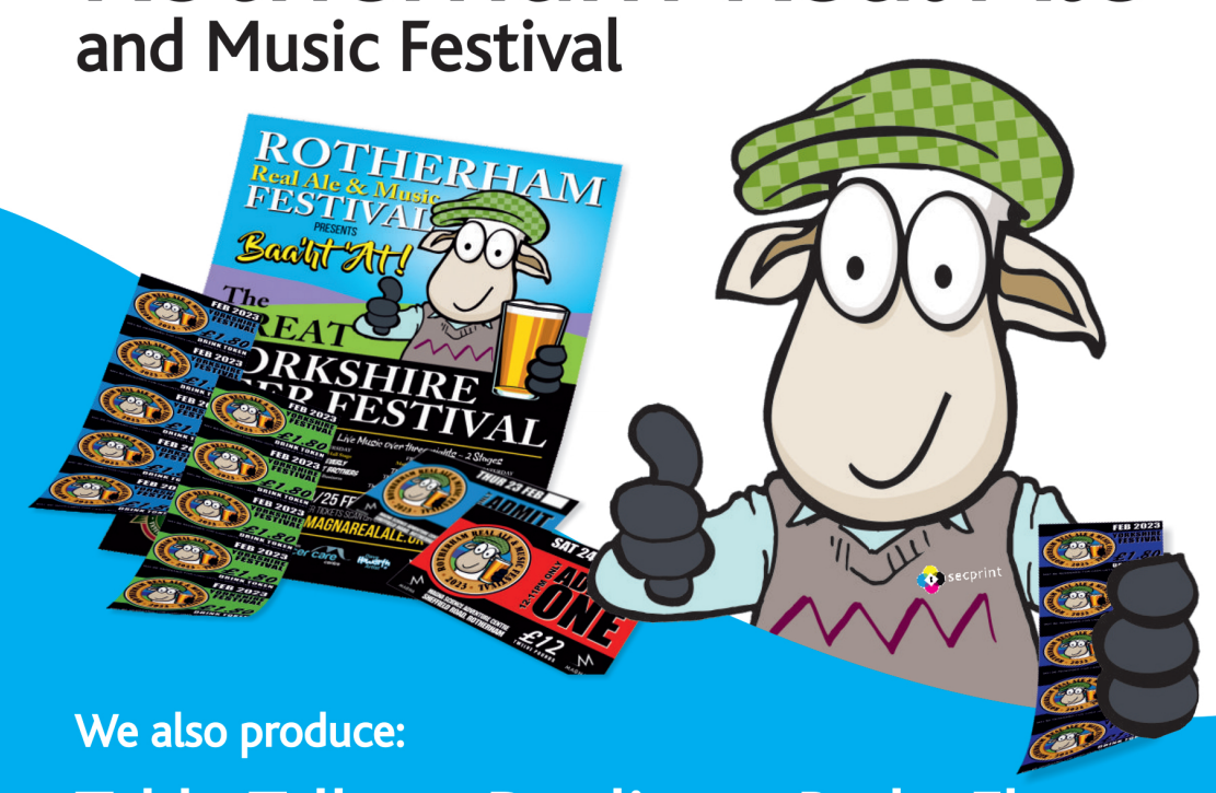
Table Talkers, Duplicate Pads, Flyers Business Cards, Wedding Stationery