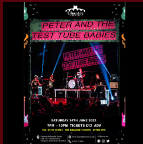
Sat 24th Jun 2023 PETER & THE TEST TUBE BABIES