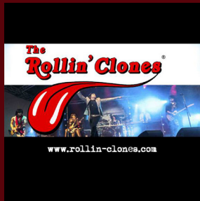
Sat 15th Jul 2023 THE ROLLIN' CLONES