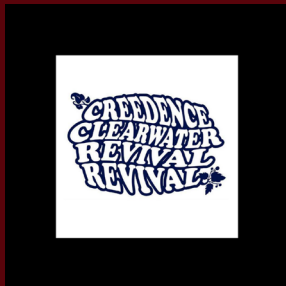
Fri 11th Aug 2023 CREDENCE CLEARWATER REVIVAL REVIVAL