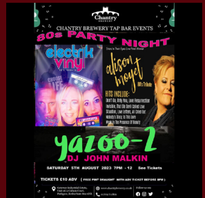
Sat 5th Aug 2023 80s PARTY NIGHT YAZOO 2 & ELEKTRIK VINYL