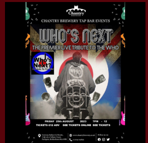
Fri 25th Aug 2023 WHO'S NEXT - WHO TRIBUTE