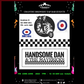
Fri 23rd Jun 2023 HANDSOME DAN & THE MAVERICKS

Unit 2, Callum Court, Parkgate, Rotherham, S62 6NR