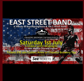
Sat 1st Jul 2023 SPRINGSTEEN - EAST STREET BAND