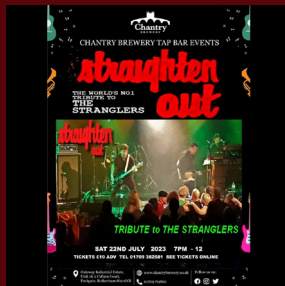
Sat 22nd Jul 2023 THE STRANGLERS