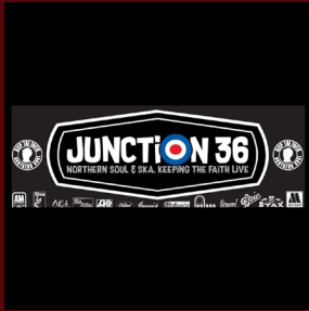
Fri 1st Dec 2023 JUNCTION 36 SKA - MOD - SOUL BAND

Unit 2, Callum Court, Parkgate, Rotherham, S62 6NR