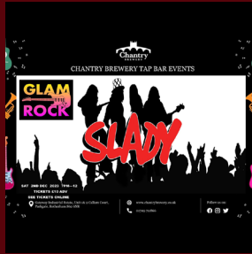
Sat 2nd Dec 2023 SLADY - FEMALE SLADE TRIBUTE