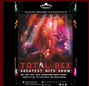
Sat 16th Dec 2023 T.REX - TOTAL REX GLAM ROCK CHRISTMAS PARTY