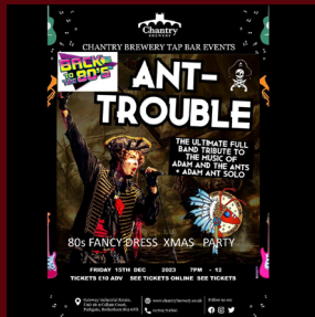
Fri 15th Dec 2023 ANT - TROUBLE FULL BAND TRIBUTE