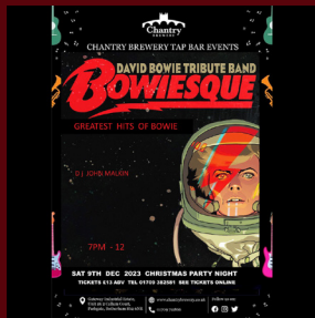
Fri 9th Dec 2023 BOWIESQUE