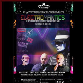
Sat 23rd Dec 2023 ELECTROMANTICS XMAS 80s PARTY NIGHT