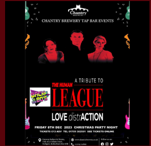
Fri 8th Dec 2023 HUMAN LEAGUE LOVE DISTRACTION - 80s